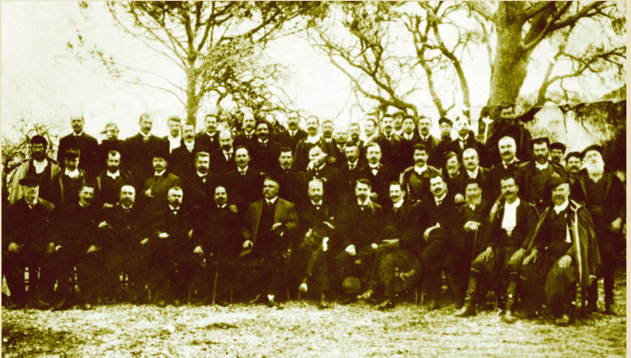
Christian plenipotentiaries of the First Cretan National Assembly that passed the first Constitution of the Cretan State. In the center, Eleftherios Venizelos