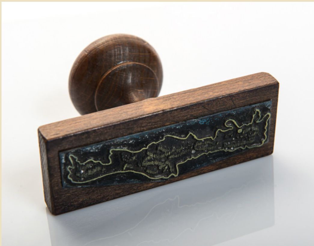
Wooden seal depicting the island of Crete