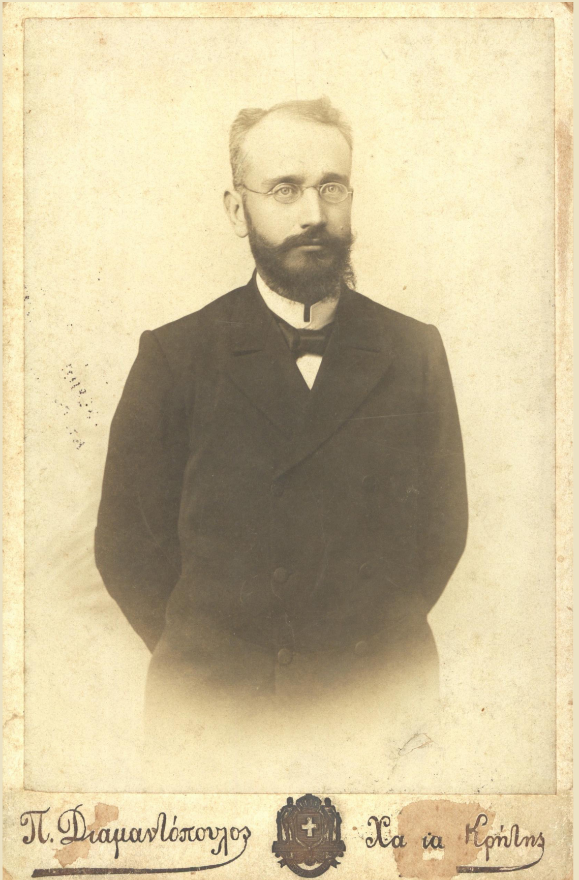
Eleftherios Venizelos, as a young lawyer and politician in Crete