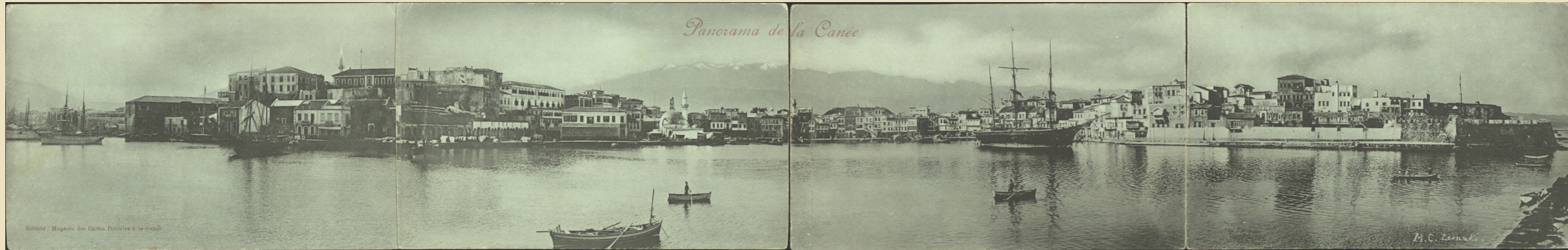
Rare fourfold postcard depicting the port of Chania