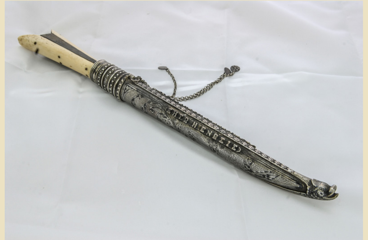
Cretan knife, decorated with savati silver, bearing the indication “Eleftherios K. Venizelos” and “Long Live the Union”