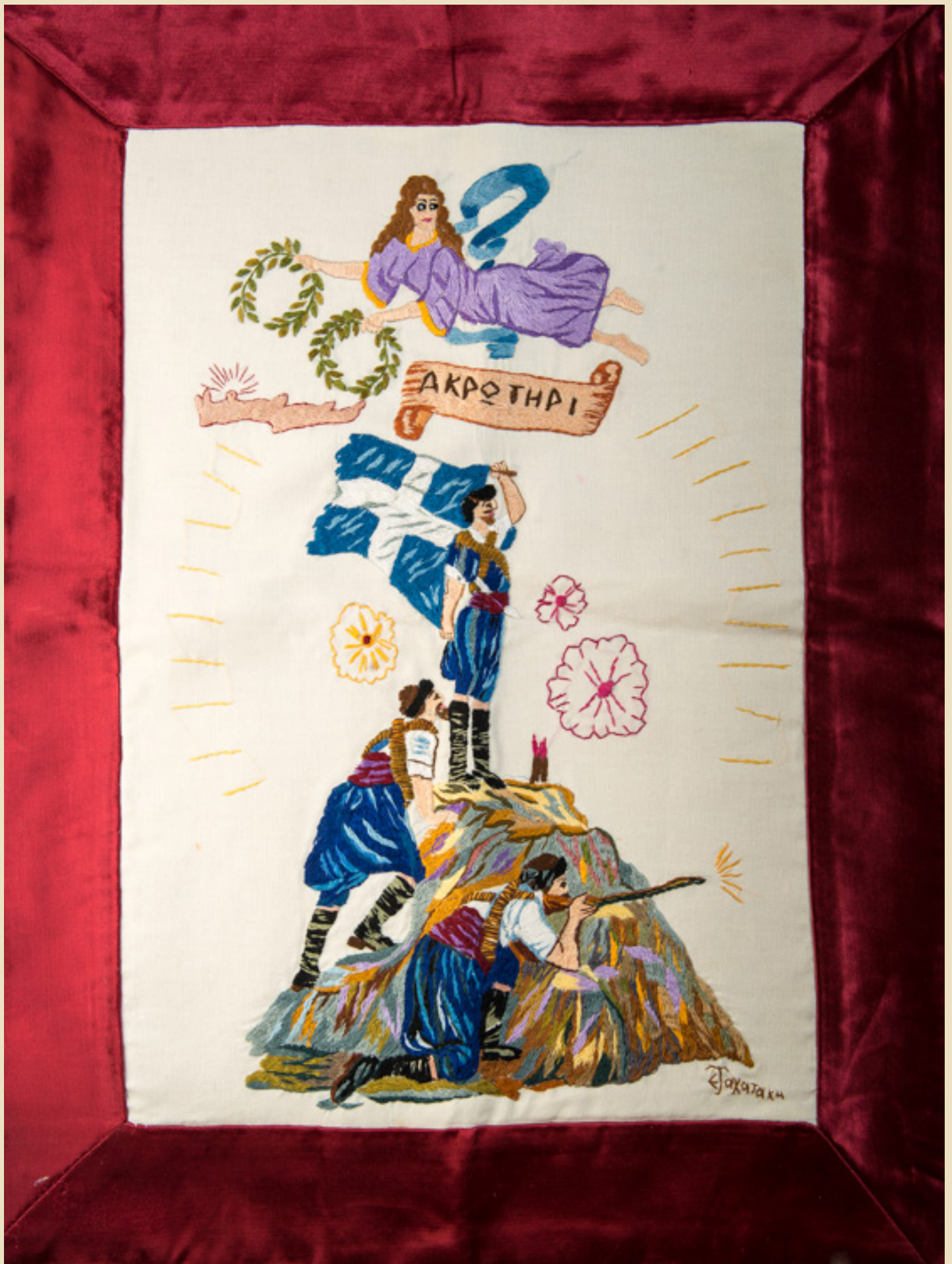
Handmade embroidery, which depicts Spyros Kagiales (Kagialeidakis) raising the Greek flag during the bombing of the revolutionary camp of Akrotiri