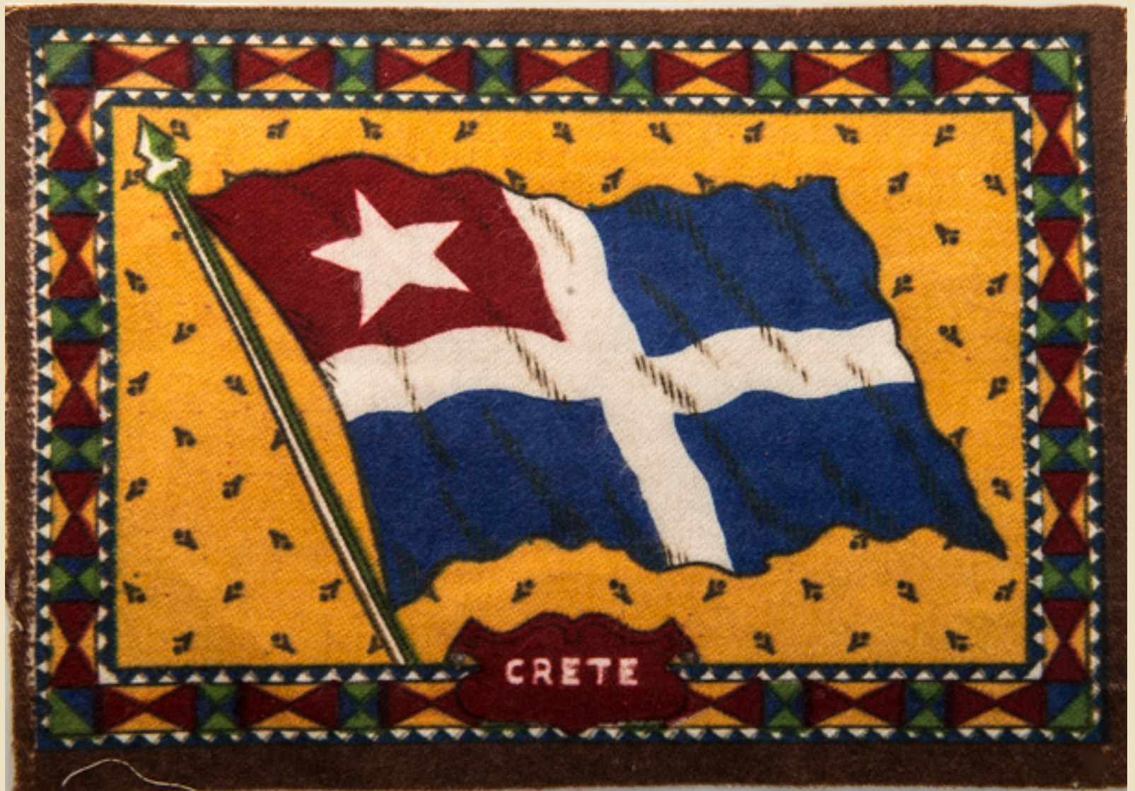
Flag of the Cretan State (1898-1913)