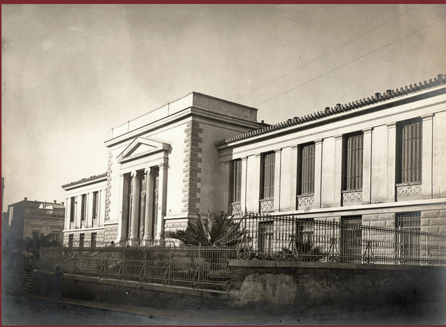
The building of the Old Chemistry Laboratory in Solonos Street, at its initial state. It was built in the late 1870s, designed by Ernst Ziller. The second floor was added much later.