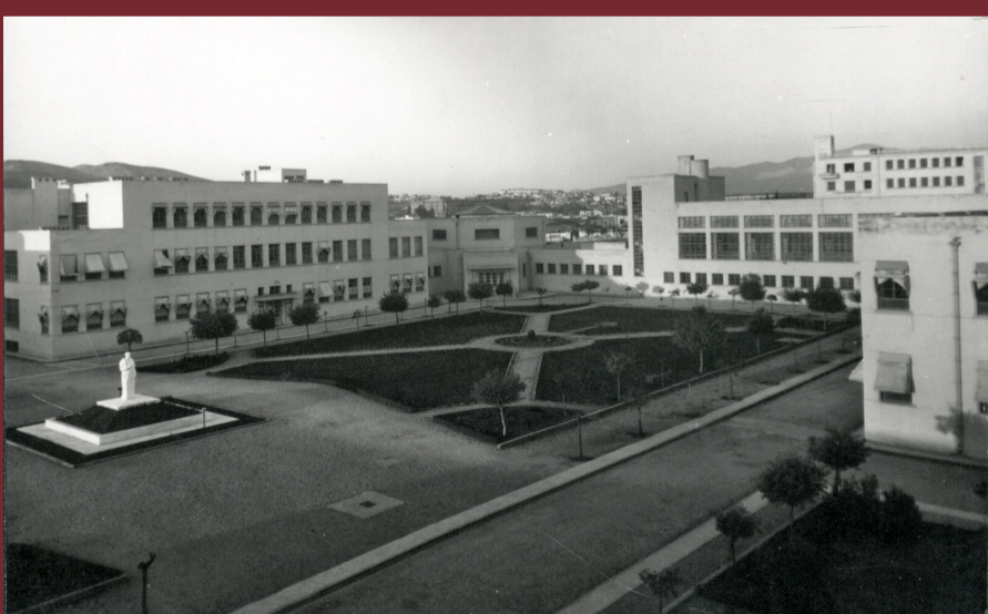
View of the School of Medicine, University of Athens

The University of Athens and its branches (Athens 1923)