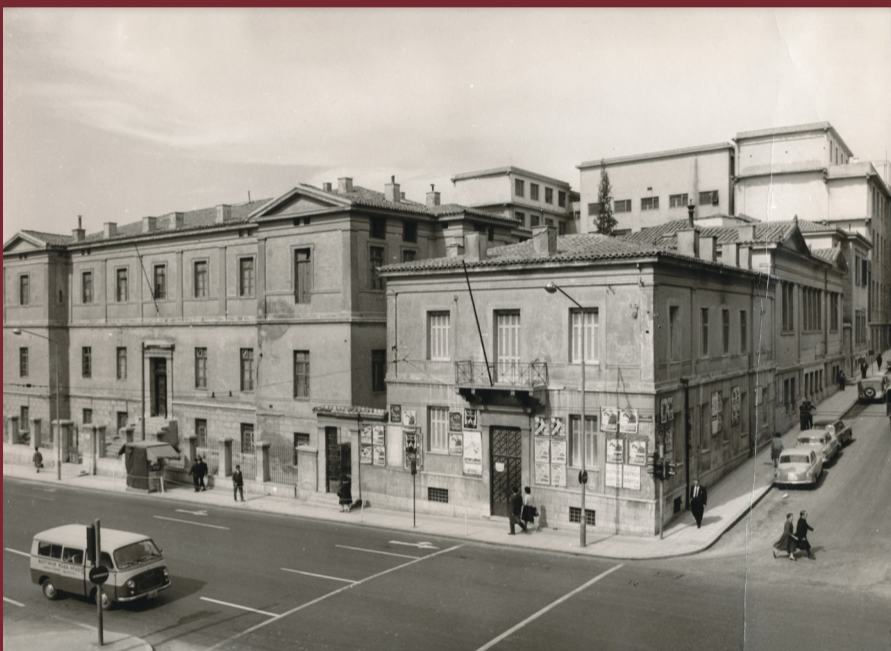
The University's Cultural Centre – Lounge (since 1985: "Kostis Palamas Building"). It was built in 1857 and, initially, it operated as a private Lyceum. In 1870, the building was purchased by the University of Athens in order to house Medical and Natural Science laboratories, lecture halls and University museums. In 1981, the building was renovated and, since then, it is being used as a Cultural Centre – Lounge, a Library and place for scientists' meetings.